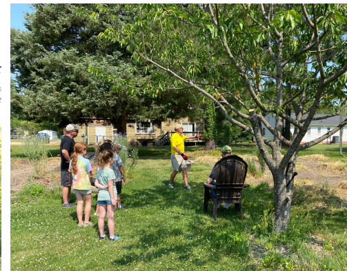
The Weinsteins "Garage School" came over to work on the garden beds.