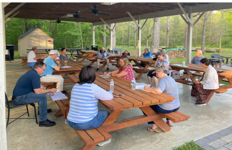
Deacons Meetings began again in person at the pavilion.