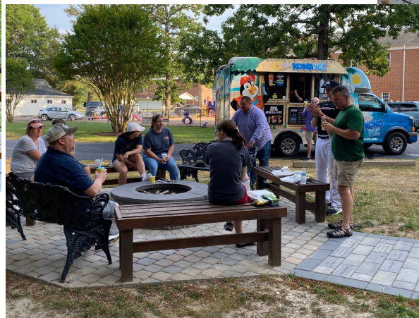
Our last Wednesday night of the spring with the Kona Ice Truck!